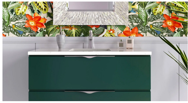
Woodinville-based vanity specialist Strasser Wood introduced NW Green as a color option in response to growing customer interest in more colorful bathrooms.

By Holly Berecz Special to At Home in the Northwest